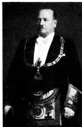
SIR JOHN TRAIN 1928-29